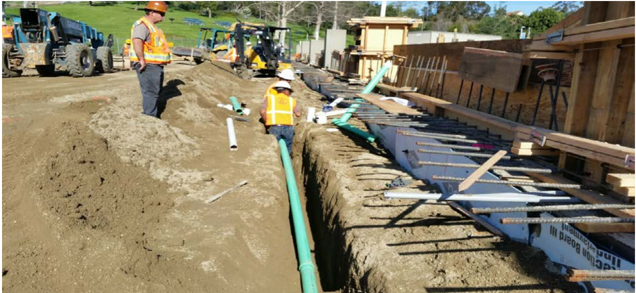
Bridge Pilaster Pot Drainage