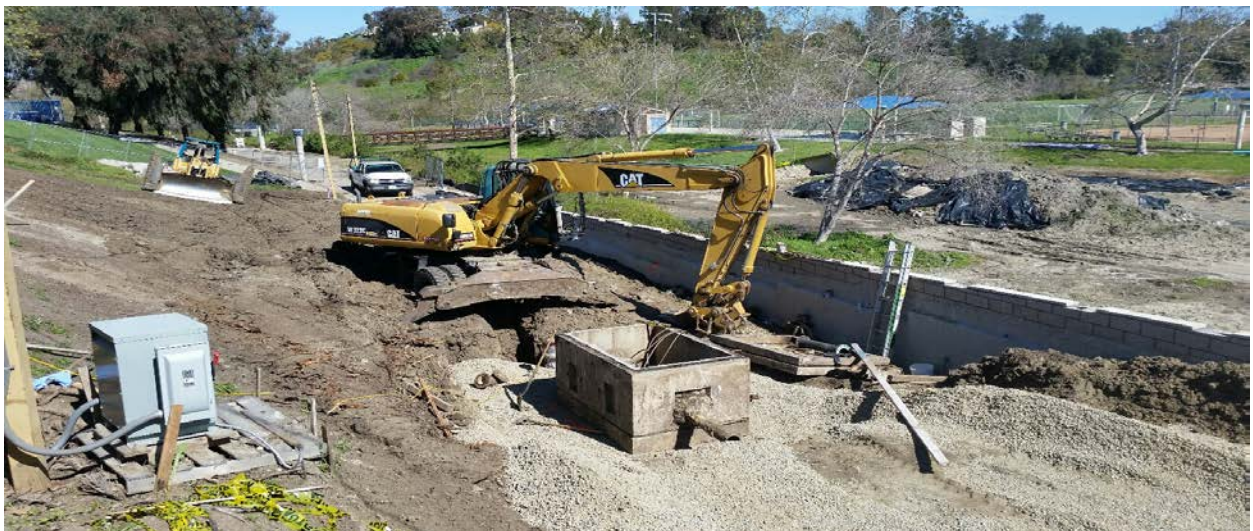
Raise In Place Reclaimed Water Meter & Vault