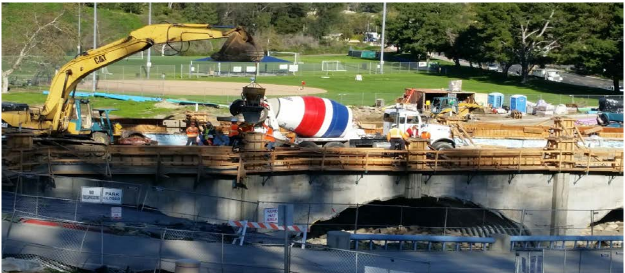
Concrete Pour For Bridge Pilasters