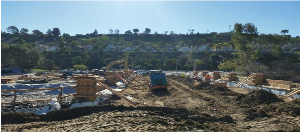
8" Reclaimed Water Bridge Crossing