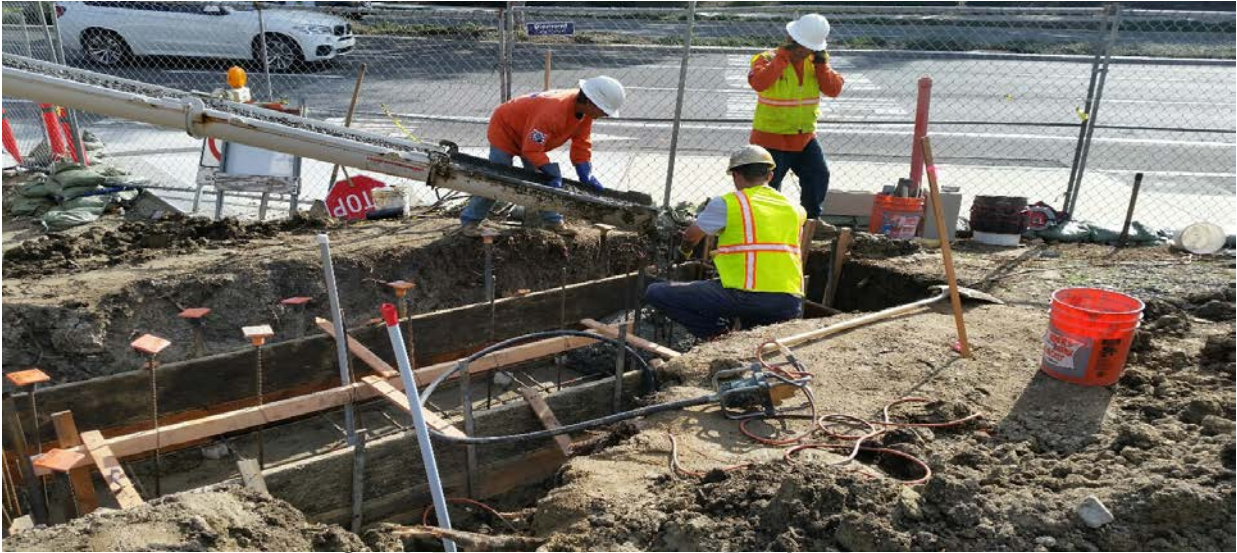
South Entrance Monument Footing Pour