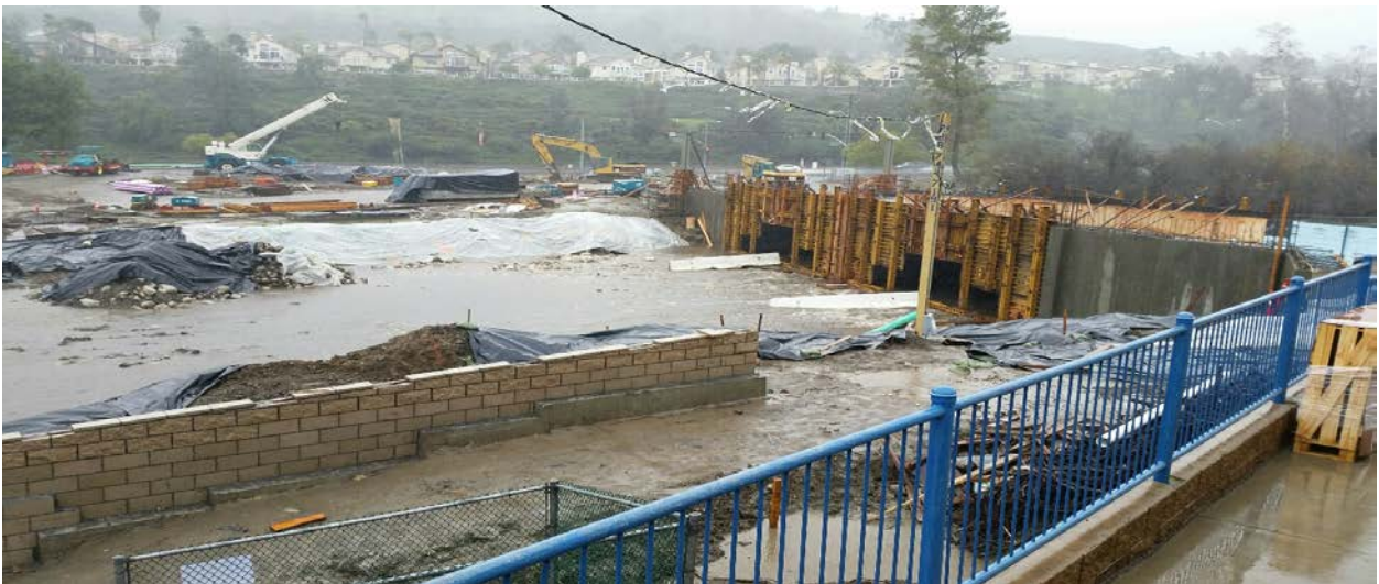
North Channel Storm Flow