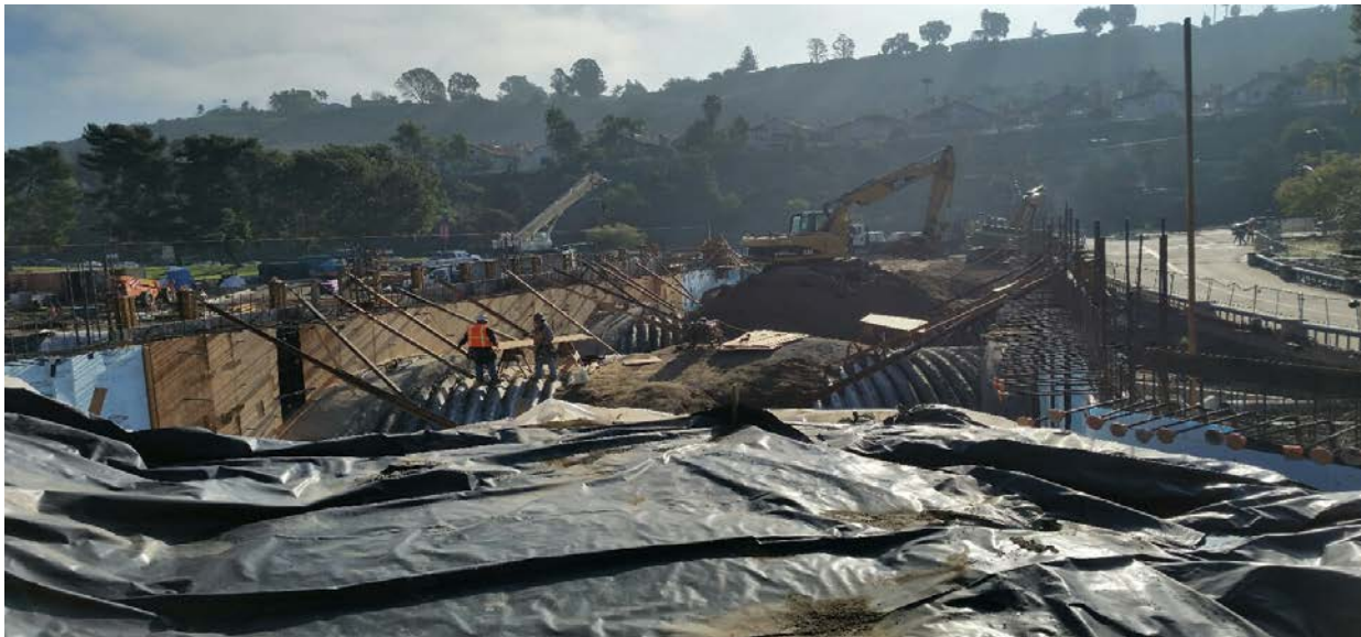
Bridge Arch Wall Bracing