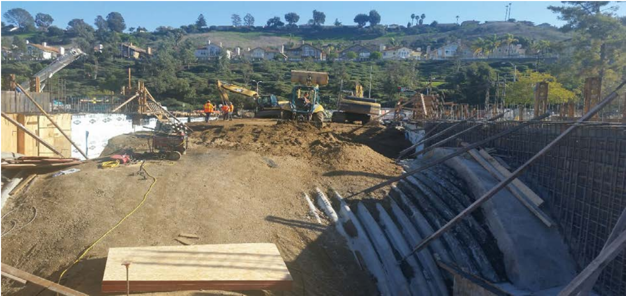
Backfilling Arch & Arch Footings