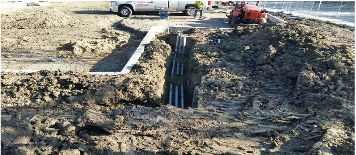
South Parking Lot Lighting Conduit