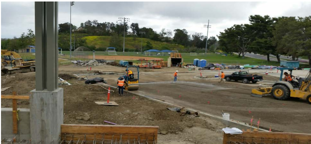
North Parking Lot Base Grading