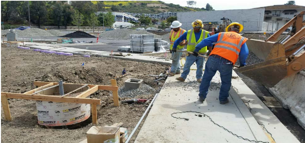
South Parking Lot Light Pole Foundation and Pull Box