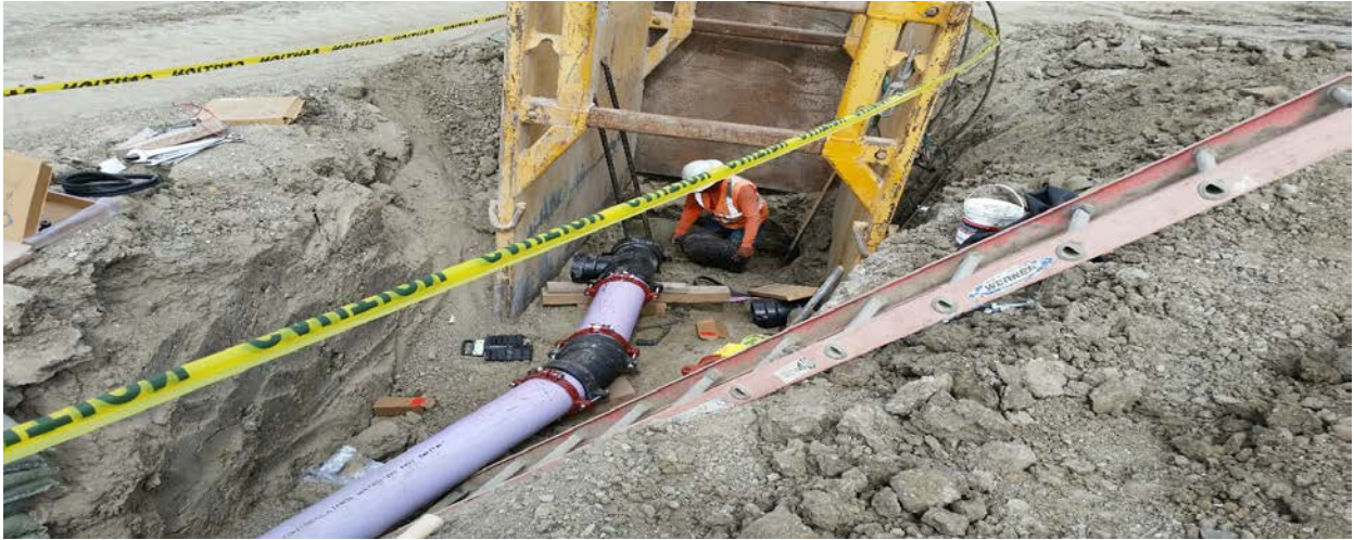
New 8" RW Service Connection Installation Preparation