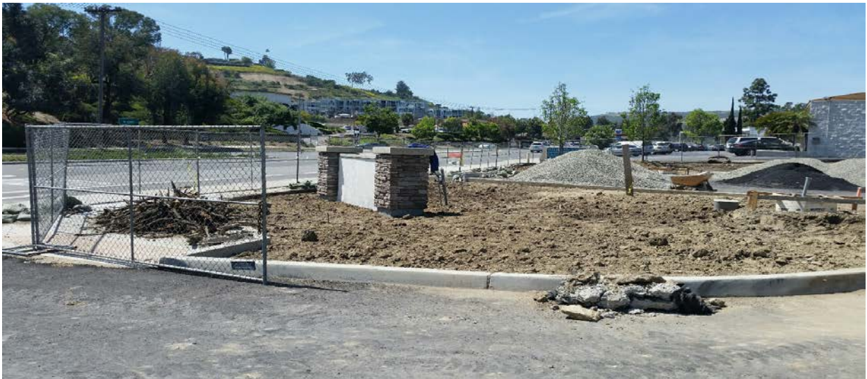
South Parking lot Landscape Planter Grading & Clean Up