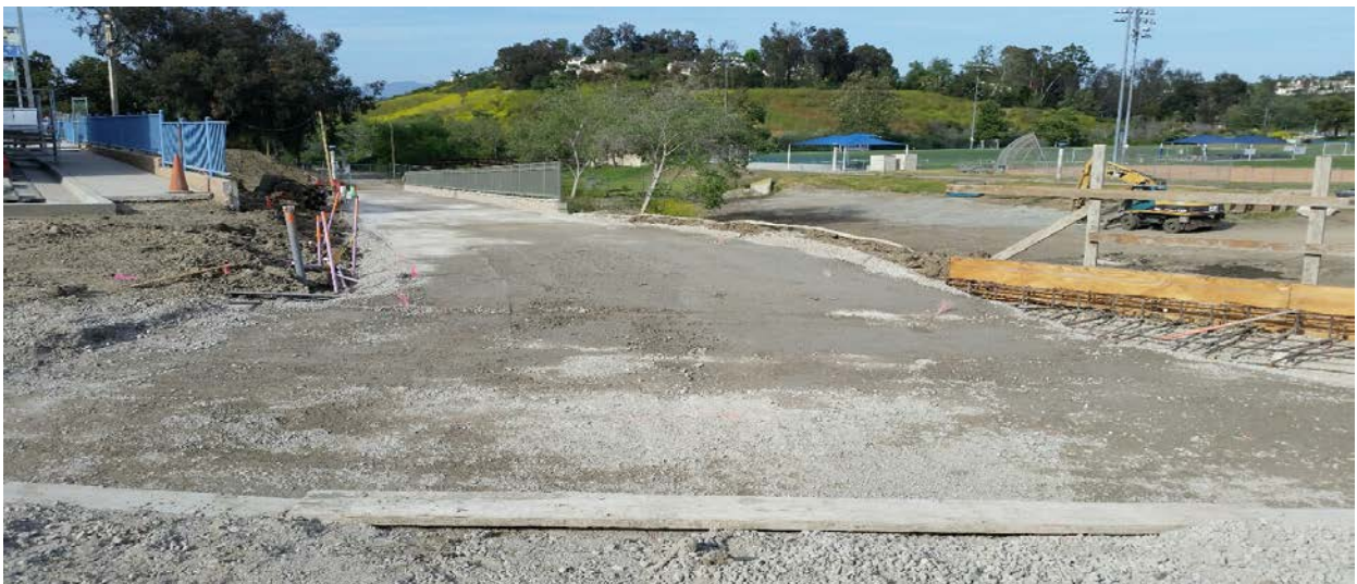
Easement/Trail Paving Base Installed