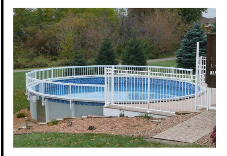
Removable fence with gate