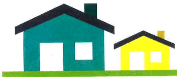
Detached Free-standing structure.