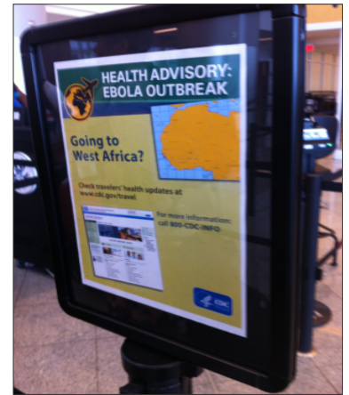
Health advisory for airline travelers