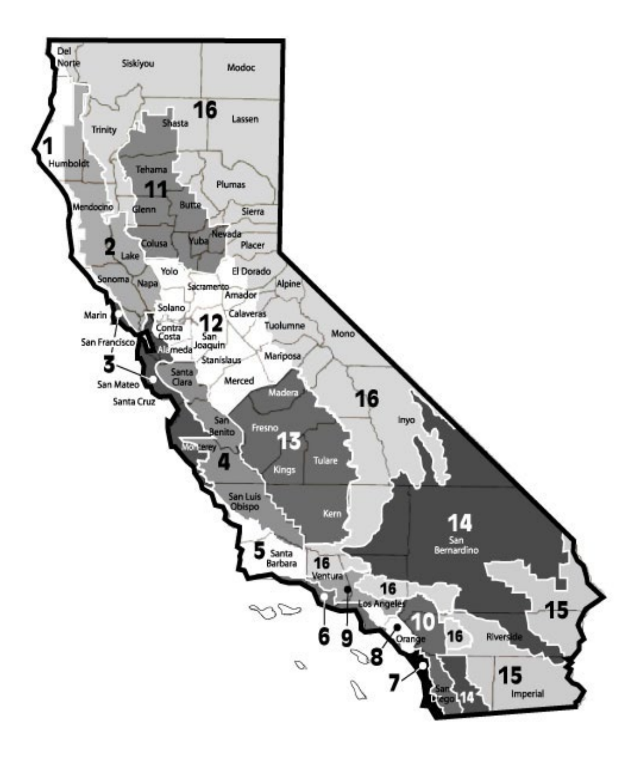
Figure 1-1: California Climate Zones