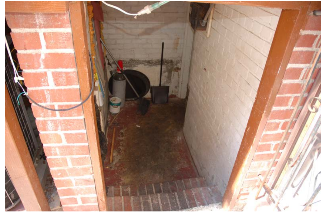
Photograph 4. Detail view of basement entry on southeast elevation.