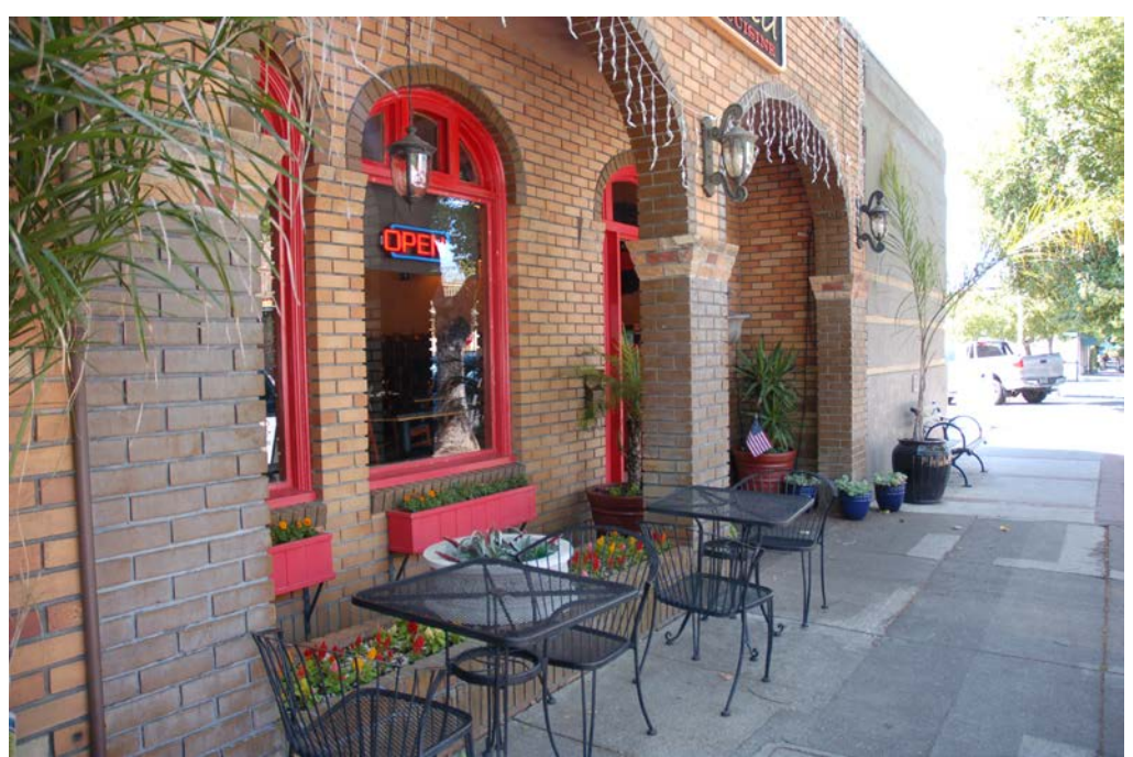
Photograph 2: View south of northwest façade of 818 First Street.