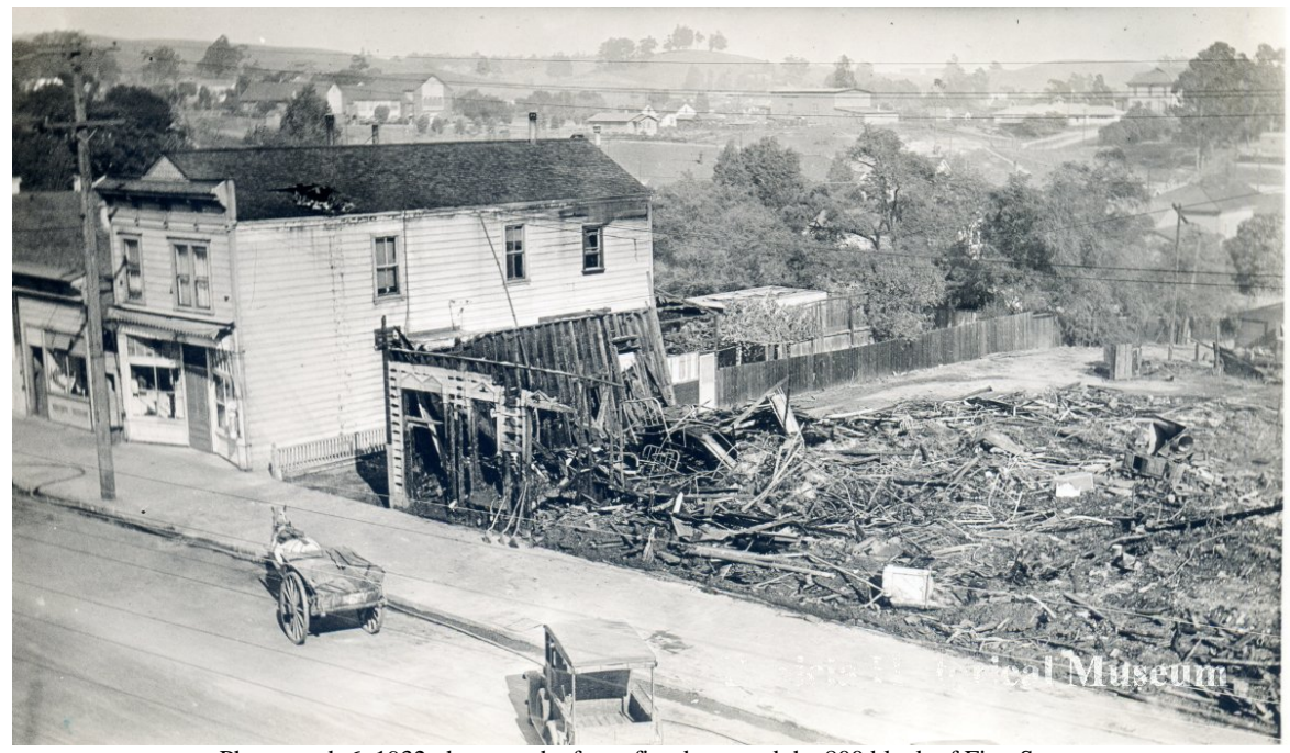
Photograph 6. 1932 photograph after a fire destroyed the 800 block of First Street.