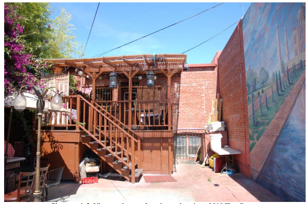
Photograph 3. View northwest of southeast elevation of 818 First Street.