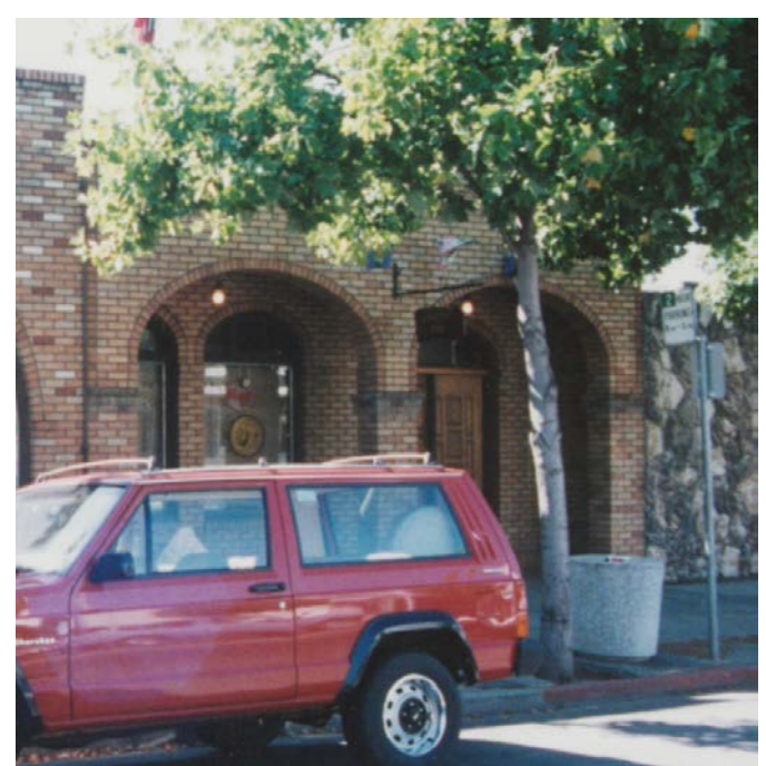
Photograph 5. 1986 view of northwest façade. Note the circa 1970 wood panel door and sidelight.