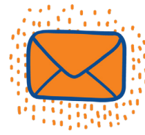
By Mail Complete and return your Census form!

All communities deserve the opportunity to thrive and provide for their families.