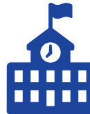
HOUSING AND EDUCATION PROGRAMS