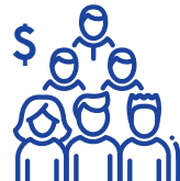
ECONOMIC DEVELOPMENT AND JOBS CREATION

Californians can help achieve a complete count by participating in one of three ways: