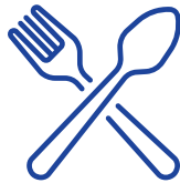
CHILDREN'S NUTRITIONAL PROGRAMS