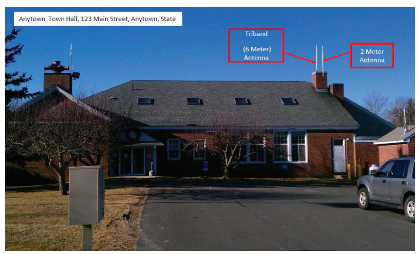
Figure 2. Example of ground-level photograph showing proposed attachment of new equipment.

Ground-level photographs. The groundlevel photograph in Figure 2 supplements the aerial photograph in Figure 1, above. Combined, they provide a clear understanding of the scope of the project. This photograph has the name and address of the project site, and uses graphics to illustrate where equipment will be installed.