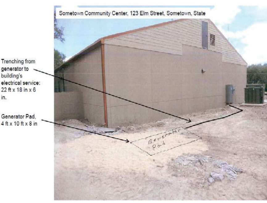
Figure 4. Ground-level photograph showing proposed ground disturbance area.