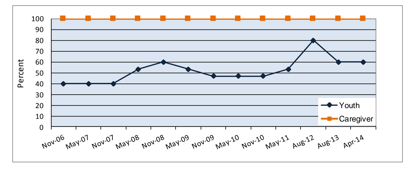
Figure 2. Youth and Caregiver YSS - Percent of Items Meeting Objective

Also of note, "Staff spoke to me in a way I understood" received the most favorable response from both parents (97.6%) and youth (91.3%) who completed the April 2014 Survey.